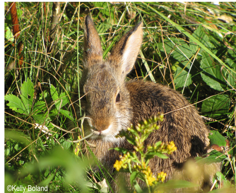
New England Cottontail

New Hampshire is rapidly losing young forests and shrublands and associated wildlife, including the New England cottontail—a state-endangered species. We are taking action to reverse these declines on this property.