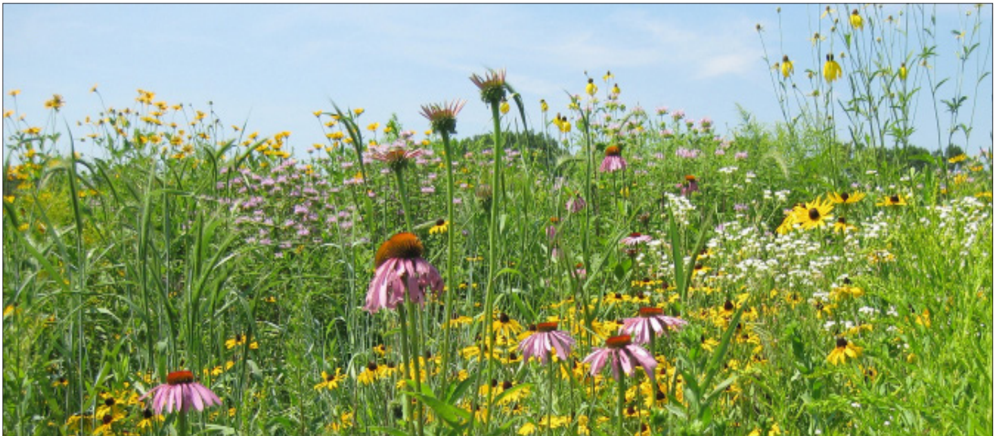
An established meadow should be dense enough to out-compete weeds and should provide a succession of diverse flowers to support pollinators.