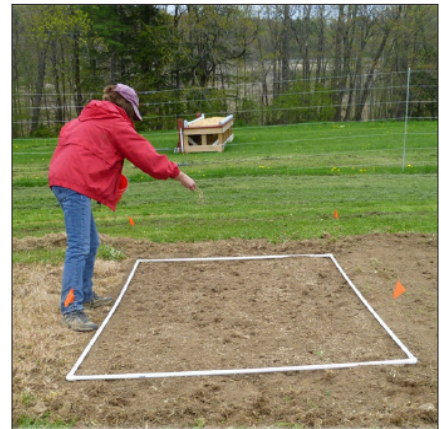
Broadcasting seed by hand over a small area.

Mix the seed with vermiculite or other carrier for one subplot at a time in a plastic paint bucket or similar container. Start with the dry carrier then add small amounts of water at a time, stirring until it is