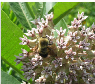
Common milkweed flowers support many bees and butterflies.