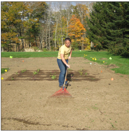
Raking lightly after broadcasting helps work the seeds into the soil.

slightly damp but not wet. Now you can mix in your seeds; the small seeds will stick to the carrier particles, keeping everything well-mixed for distribution. Add the wildflower seeds first, then the grass seeds, adding more water or vermiculite if needed. The precise amount isn't important, but using 0.5 to 1 gallon of the carrier per 500 square feet area is adequate. Wearing latex gloves will keep the seed from sticking to your hands.