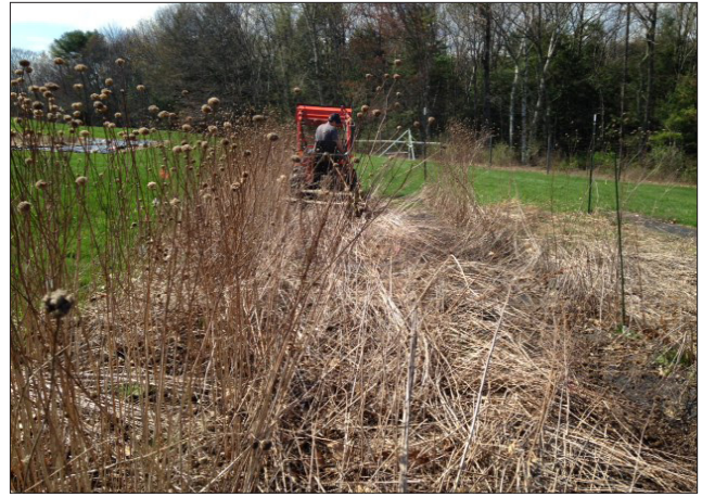
A meadow does not need a dormant season mowing every year, just often enough to keep shrubs and trees from growing up.