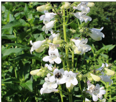
A bumble bee delves into foxglove beardtongue.

Soil testing can provide you with useful information regarding pH and organic matter content, but wildflowers generally prefer low fertility sites. Determine whether the soil tends to be wet or dry, and if the site gets full sun, filtered sun or shade.