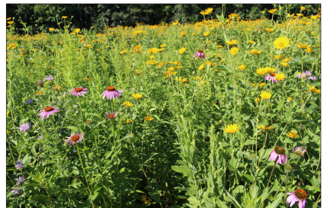
Third year after planting (early August).