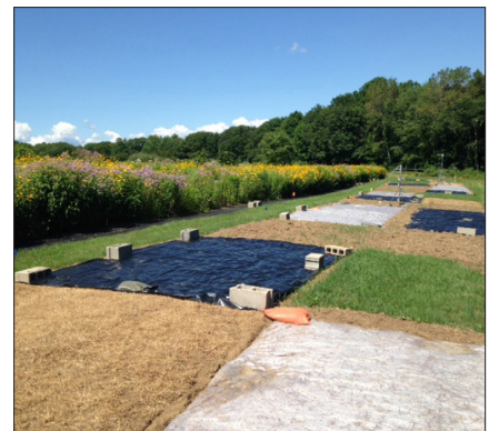
Overview of research trial comparing various methods of site preparation for killing existing vegetation before seeding a meadow mix.