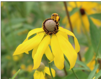
A pollen-loaded native bee on yellow coneflower.