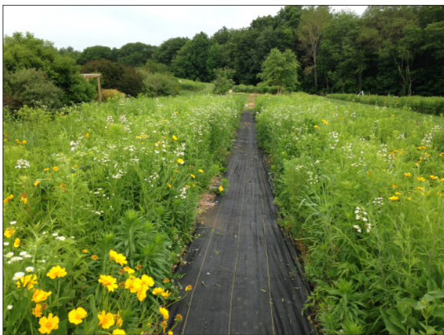
Second year after planting (mid-June).