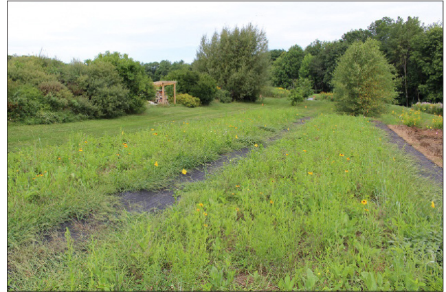
First year after planting (mid-August).