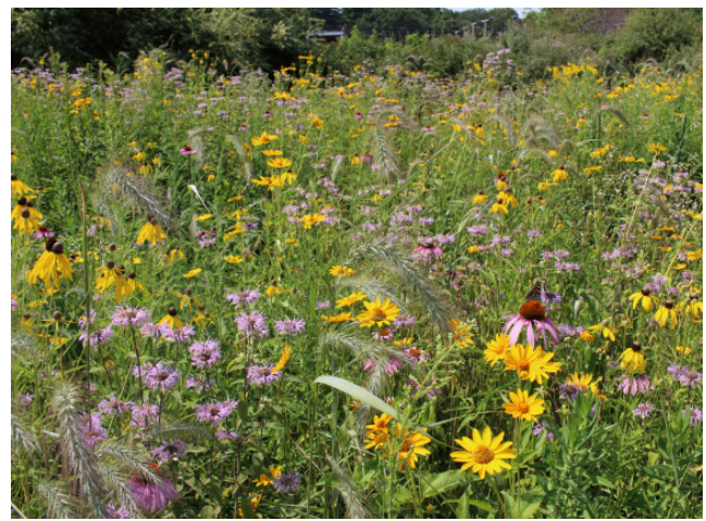
Second year after planting (early August).