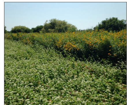
A buckwheat cover crop in front of a previously established meadow.