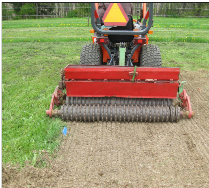
Rolling with a cultipacker (shown here) or lawn roller ensures good seed to soil contact.

For each subplot, apply half the amount of seed while walking back and forth in one direction, then repeat in the other direction, as shown in the diagram below. Using a light-colored carrier such as vermiculite allows you to see how evenly you have distributed the mix on the soil surface. Scatter any remaining seed where needed.