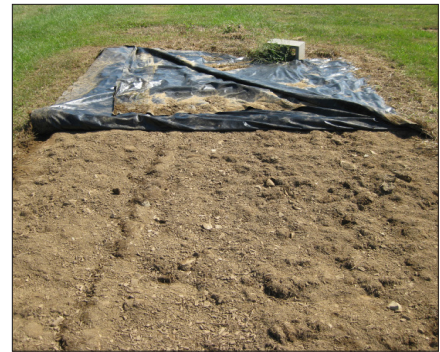
A clean seed bed is exposed when black plastic is removed in September, after being in place for several weeks.