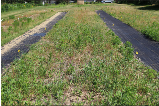
First year after planting (mid-June).

These photos show the growth and development of the same meadow planting over time.