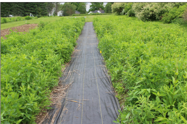
Third year after planting (early June).