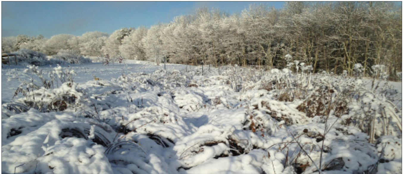
The meadow in winter.