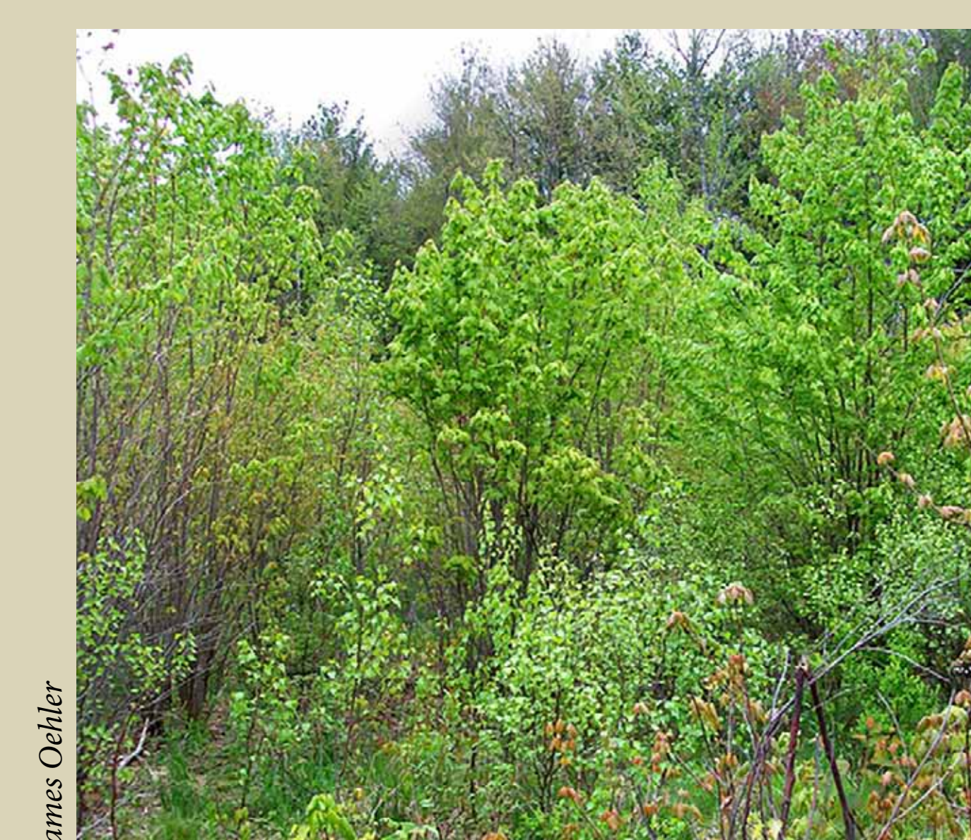
after 10 years

After 10 years, taller trees start shading out some of the ground plants, but the regrowing forest still provides important food and cover for bobcats, woodcock, songbirds, and a host of other creatures.