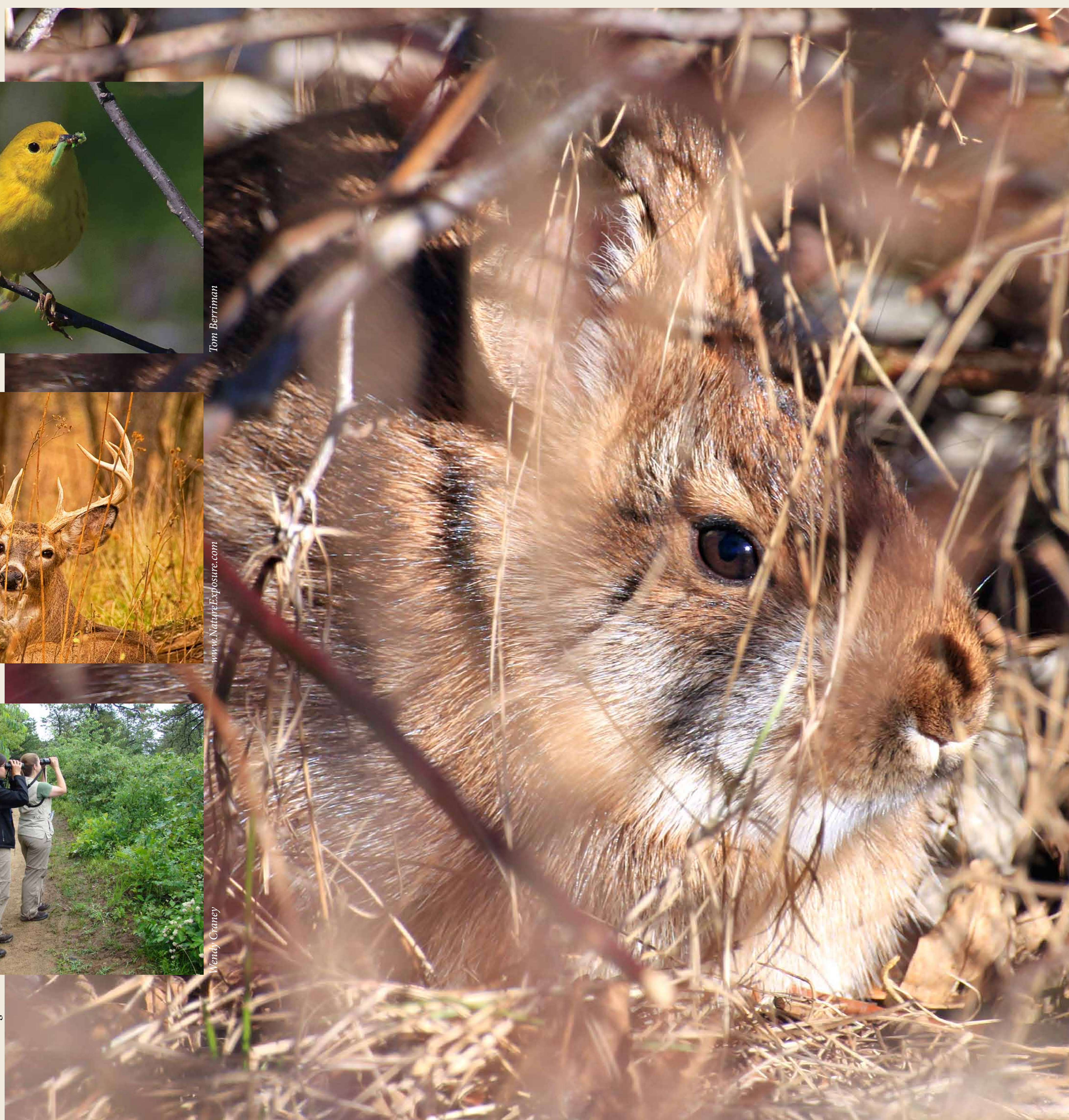
a fresh cut

Public and private landowners plan and carry out timber harvests to create and refresh patches of young forest in strategic areas within more-mature forested landscapes. Habitat managers also use other techniques, including controlled burning and mowing shrubs, to keep the right amount of young forest on the land.